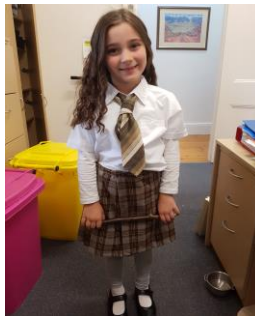
Violet's new uniform idea